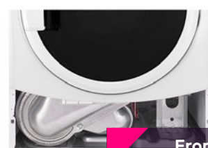
Front Access Panel