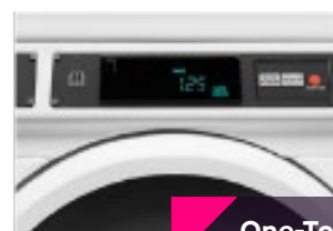
One-Touch Cycle Selection